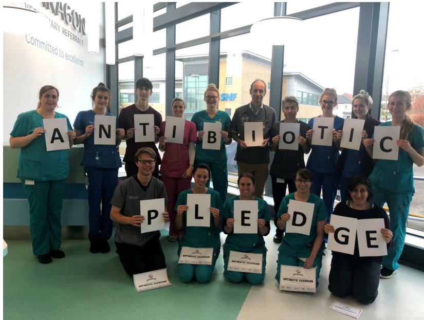
Figure 1: Photo from 2019 when the scheme was launched and nearly 100% of team members pledged to be antibiotic guardians. This was promoted on social media to reach a larger audience.

The team brought together learning from CPD events with clinicians and clinical pathologists discussing antimicrobial stewardship and the experience of an internal medicine specialist leading the group to form a basis of knowledge to inform their project.